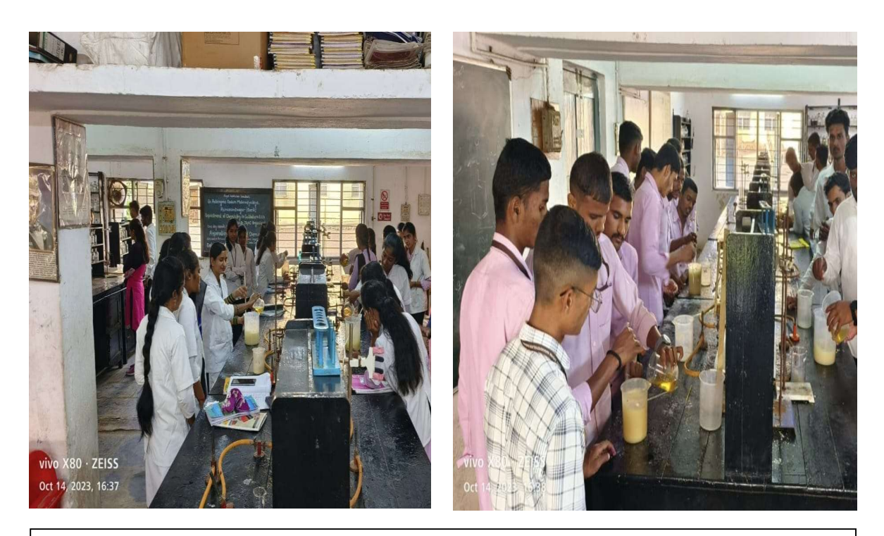
Students Preparing the white phenyl and black phenyl